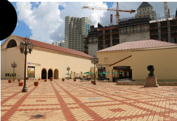
Cross the Miami-Dade Cultural Center Plaza to HistoryMiami Museum.