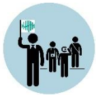
Tour Waiting Area