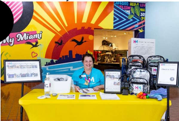
Check-in with museum staff in the Museum's North or South building lobby. There may be a line to wait in. At check-in, our staff will ask the name(s) you have registered under. Everyone will receive a wristband to wear.